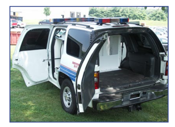
Yukon/Tahoe 32" K9 Kit (KK-K9-C14-K-32)